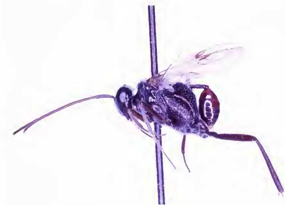
Fig. 1. Evania appendigaster (Richmond, VA) lateral view, forewing length 5.8 mm.

handwritten, and reads “R. Murrill U. of Richmond, Va. 15 x 1937.”